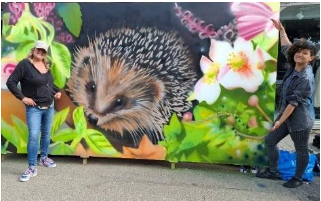
"U Can Spray" mural

Additionally a Hedgehog Information Obelisk, a nine-foot-tall structure, displayed posters from a range of hedgehog and wildlife charities. It drew a lot of attention and volunteers gave out information about Hedgehog Street and Thorne Hedgehog Rescue.